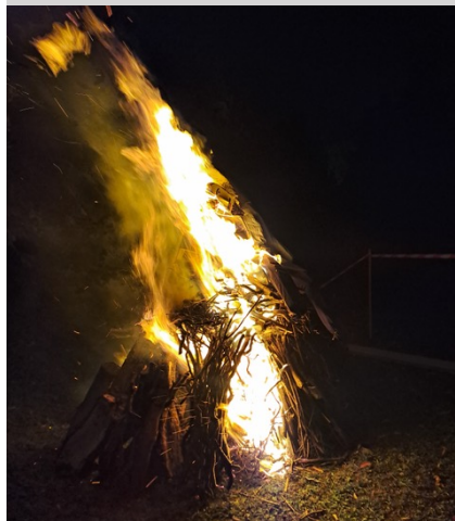
Bye Bye Guy Fawkes