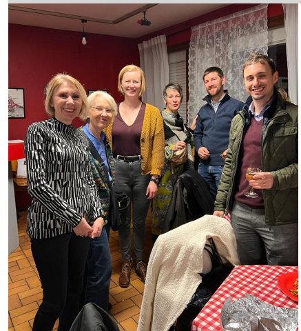
Apéro at Le Cube Noir