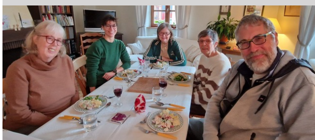
Brewery Visit and Lunch in Uberach