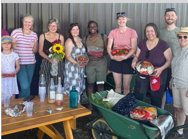
Garden picking in Eckwersheim