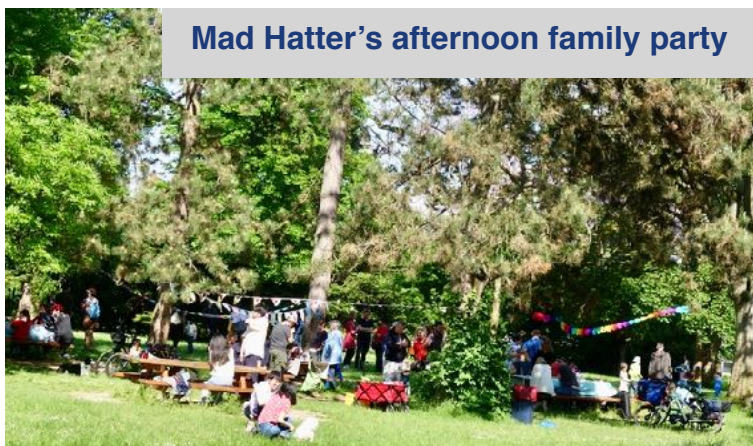
Mad Hatter's afternoon family party