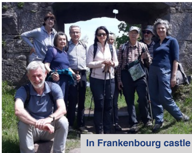
In Frankenburg castle