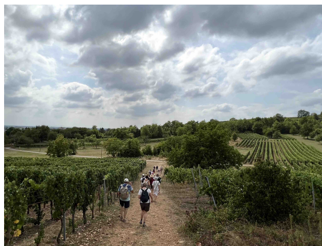
Marche gourmande in Obernai