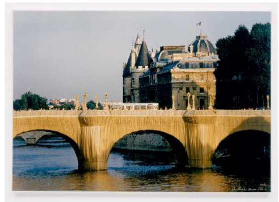
The Pont Neuf Wrapped, Paris 1975-85

and (below) an excerpt from Wikipedia's article about them: https://en.wikipedia.org/wiki/Christo_and_Jeanne-Claude