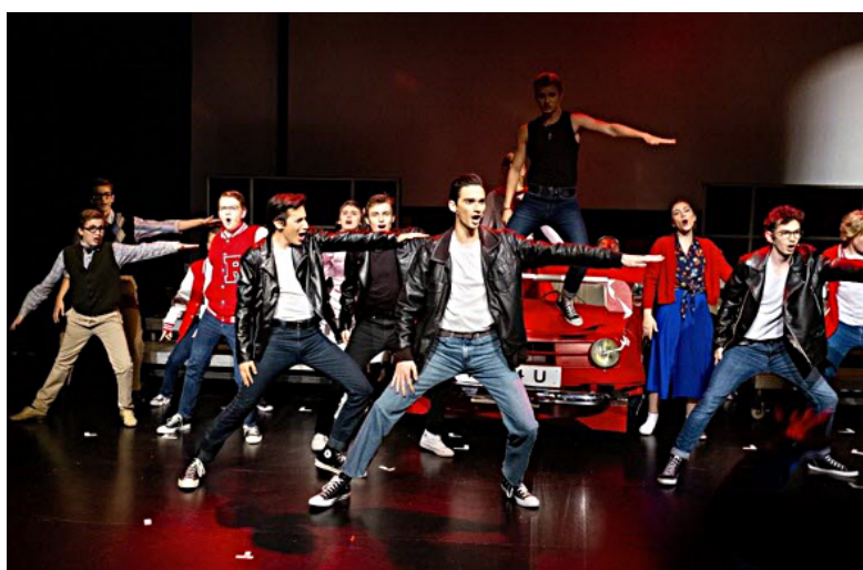
« Grease » by YATS, in the service of middle school and high school students in Alsace